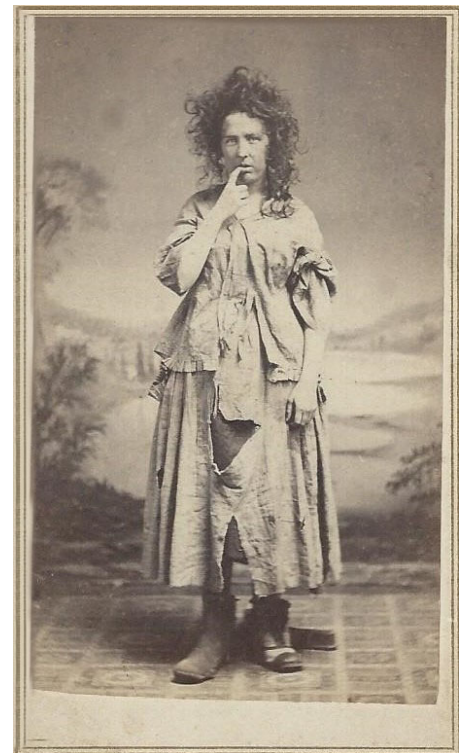
Ragamuffin (circa 1863-1864)