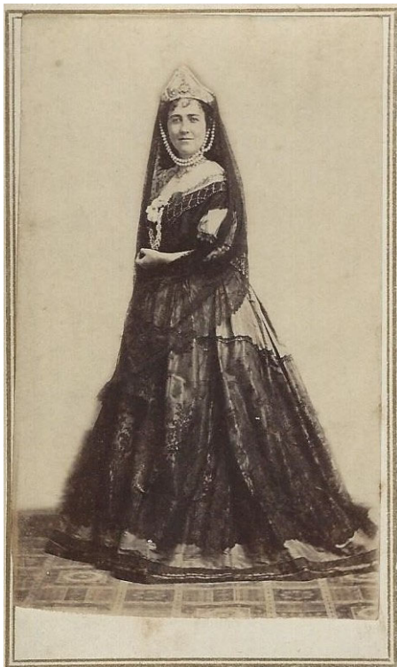
Tiara (circa 1863-1864)