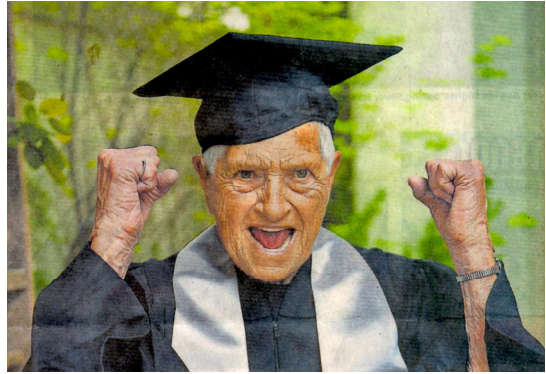
Reno Gazette-Journal, May 18, 2019, pg. 1.